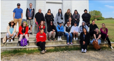
DTI ABE and PN Students at Batoche 2023, photos by Trenna Vanghel

For a full listing of all current programs and to apply online visit WWW.GDINS.ORG/PROGRAMS