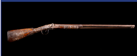
Hollis & Son's Hudson's Bay Company Indian Trade Fusil c. late 1870s